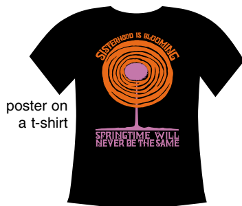
poster on a t-shirt