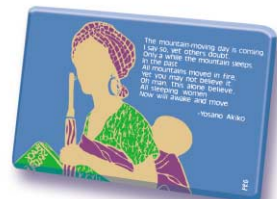
▲ posters on magnets (2"x 3")