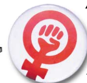
buttons ◀ (1.5")